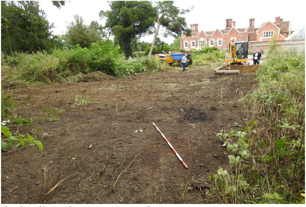
Plate 2: Looking south at commencing topsoil strip.