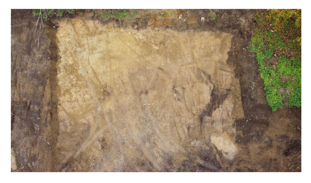
Plate 4: Aerial view of exposed site.