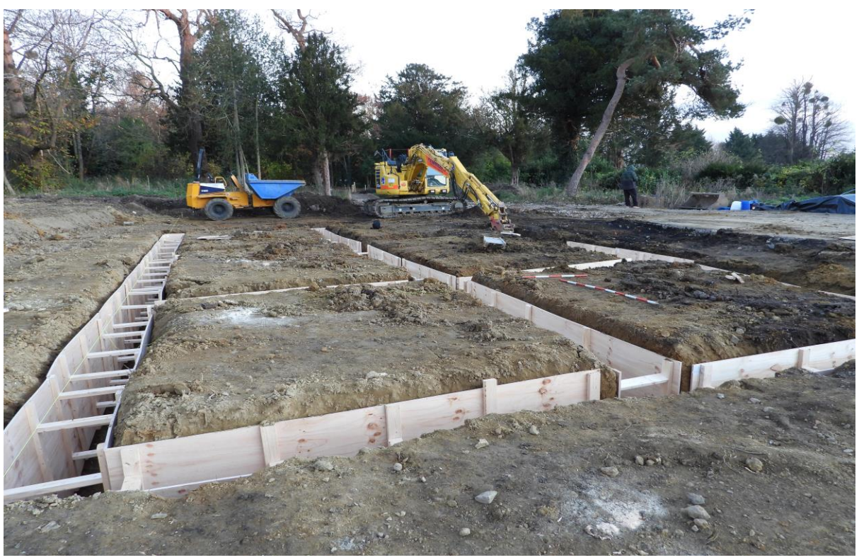
Plate 5: Excavation of foundations. Looking east with one- and two metre scales.