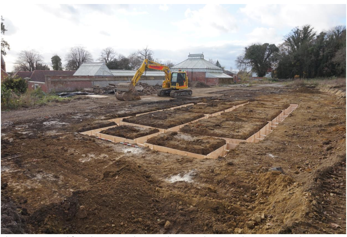
Plate 5: Excavated foundations. Looking southwest with one- and two metre scales.