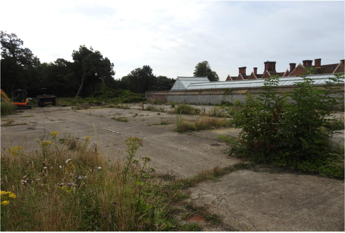
Plate 1: The site looking east prior to the clearance of overburden.