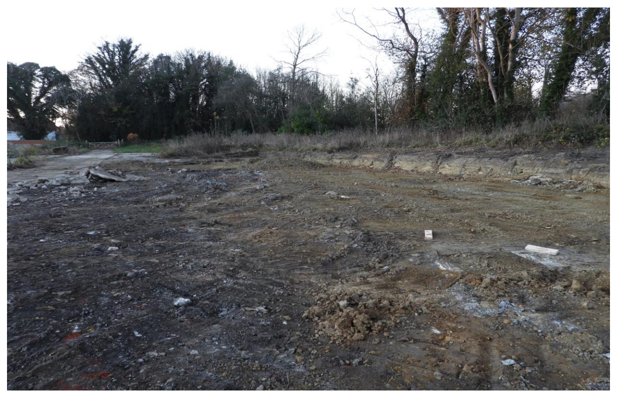
Plate 3: Showing the strip. Looking west.